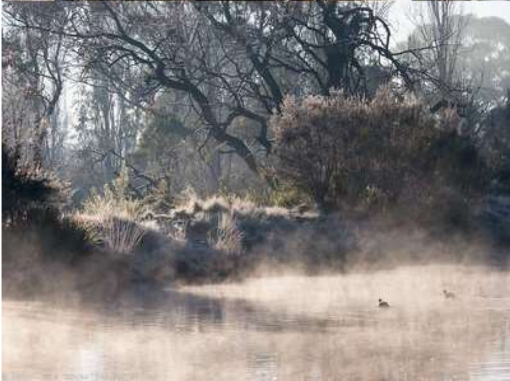
Celebrations continued with planting tours, more cake, music and a big Koala at the Black Gully Festival