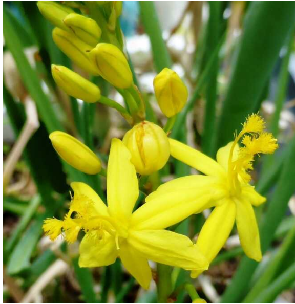
Bulbine bulbosa

Some plants look soft but have proven to be tough, e.g. Correa glabra “green”, also other correas , Grevillea iaspicula “Wee Jasper”, Grev. arenaria and Babbingtonia “Clarence River Weeper”.