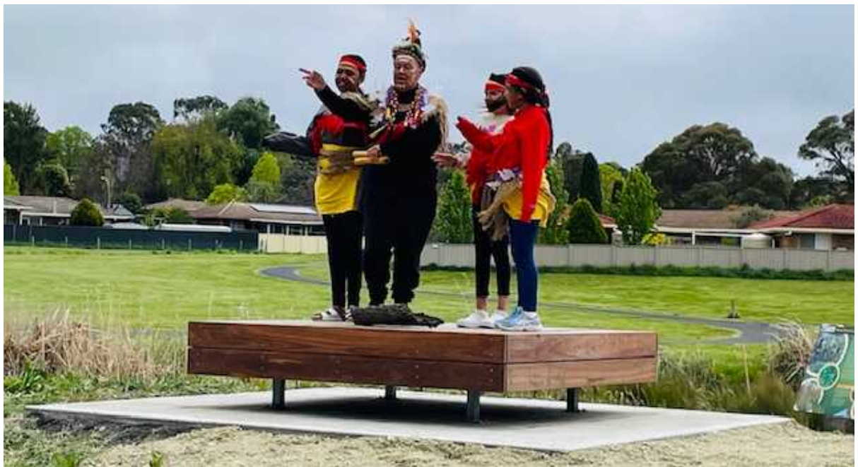
We were welcomed to the opening of the WW2WW by local dancers.